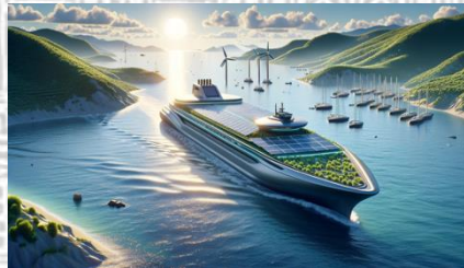
New Ship Designs