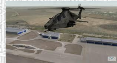
Bell Helicopters Simulation Manufacturing