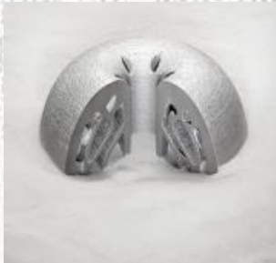
Predictive maintenance Probe head for taking gas samples