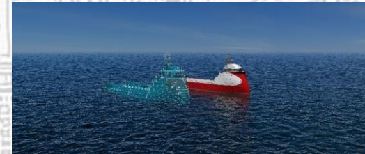
Maintenance Understandable language for diverse teams