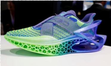
Customization, Inventory, Speed, Cost