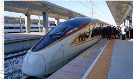
Fixed route, 217mph