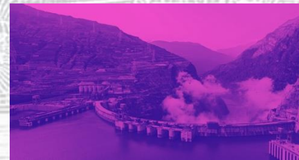
3d Printed Parts Self built Dam