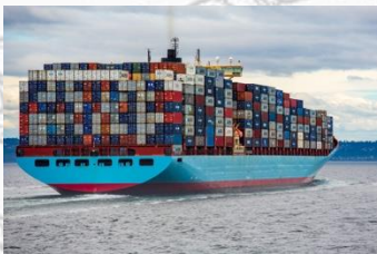
Cargo? No industry will be spared