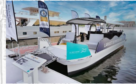
Al Seer Marine, largest 3D printed boat (11m)