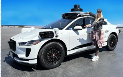
5 levels of autonomy