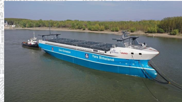
Yara Birkeland, Norway